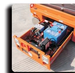
Slide Out Tray