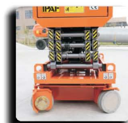
Compact Turning Radius