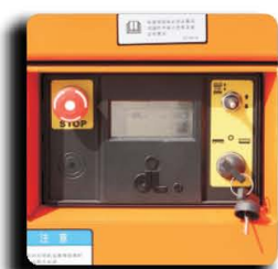
Touch Display Screen